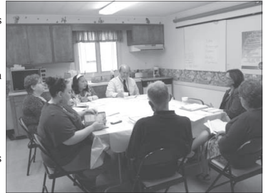
Smooth transition: Members of the Niagara County Mental Health department and the YWCA of Niagara discuss the agency's addition of the rape crisis and sexual assault services previously provided by the county.

trained staff are committed to providing preventive education to schools, universities and community groups upon request.